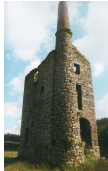
Medlyn Moor engine house.