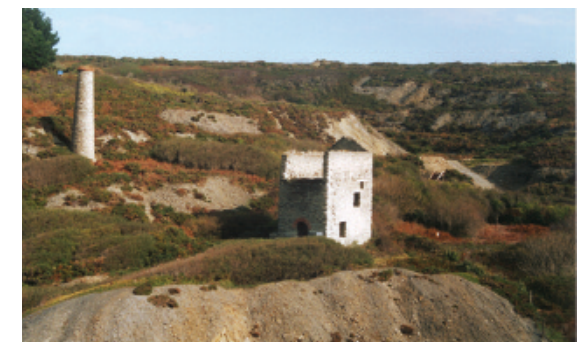
Blue Hills Mine.