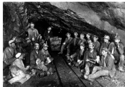
Miners at croust time in Cook's Kitchen Mine, 1893.